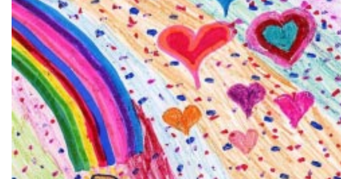
Bethany -- 5th Grade

Classics for Kids c/o WGUC 1223 Central Parkway Cincinnati, OH 45214